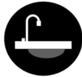
ARTIFICIAL STONE (e.g. countertops)