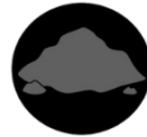
SAND/ FILL DIRT/ TOPSOIL